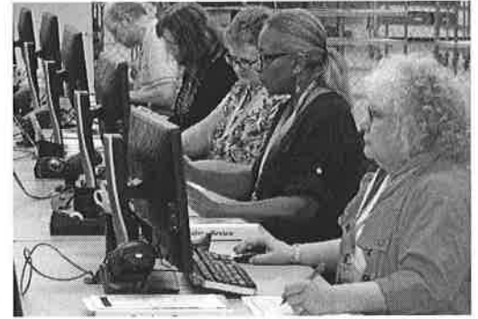
Election workers verifying signatures

King County Elections strives to maintain an environment of continuous improvement and has instituted process improvements that save time and contain costs. One potential improvement is automating the signature verification function during the processing of ballots. To that end, the Department has initiated a project to evaluate the feasibility of Automated Signature Verification systems, a tool that could substantially reduce the time taken to process incoming ballots, reduce the number of election workers needed to process ballots and consequently reduce costs.