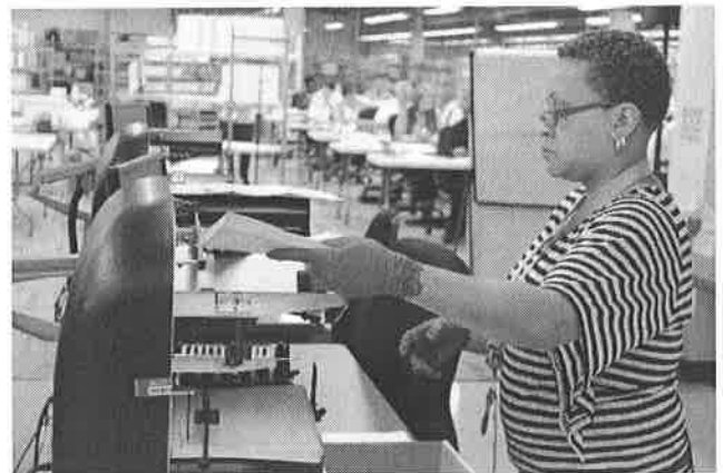
Election worker scanning ballots

The system currently used to scan ballots, record voter selections and calculate election results - together called the "tabulation system" - is made up of sixteen specialized high-speed document scanners, corresponding tabulation software and dedicated servers. The system runs on a Windows XP platform that is no longer supported by Microsoft. The scanning hardware is currently in year nine of a planned ten-year life cycle. Further, the system has reached its maximum bandwidth and cannot be configured to grow as our need for processing capacity increases. We are evaluating systems that are currently in the process of becoming federally and state certified that meet