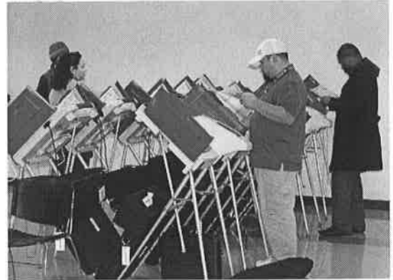
Voters using AVUs at Accessible Voting Center

AVU's are deployed at Accessible Voting Centers (AVC's) and are available to all voters who need or want an in-person voting option. The current accessible voting system hardware is approaching its useful life cycle and the software's operating system is over ten years old. Replacement of the system as a whole is needed. The software used to operate the accessible voting solution must be compatible with the tabulation and election management systems and any new solution is subject to the same federal certification requirements and timelines.