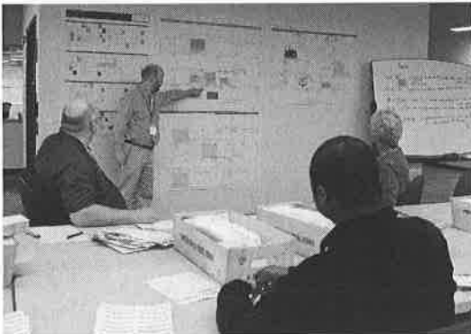
Staff working on the implementation of the new Election Management System.

The application at the heart of election administration work is the Election Management System (EMS). The EMS is the database housing all voter, jurisdiction and contest records. It is the official repository of voter registration data. This database also contains an integrated Geographic Information System (GIS) component that maintains the relationship between each voter and their precinct. The EMS also captures and stores electronic images of voter signatures and is used to confirm voter identity during petition verification and ballot processing.